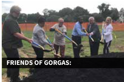
FRIENDS OF GORGAS: