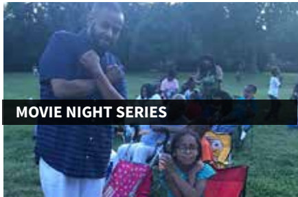
MOVIE NIGHT SERIES

There are great things happening in the 4th district. Below are just a few events that highlight the great things that the 4th councilmatic district has to offer!