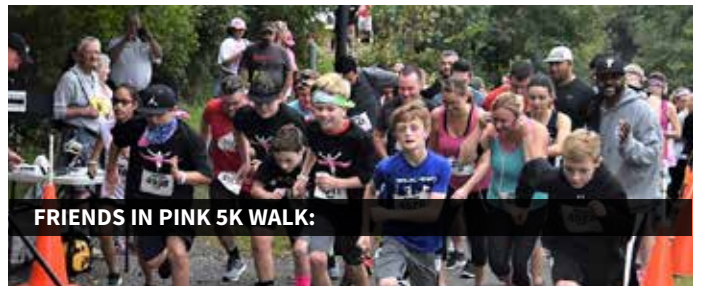
FRIENDS IN PINK 5K WALK: